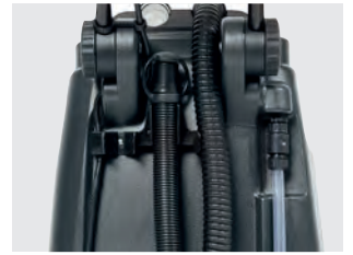
Drain hose for easy emptying