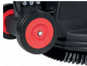
Large rear wheels facilitate transport and ensure good maneuverability