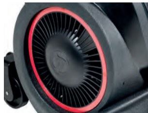
High quality air fan with filter protection