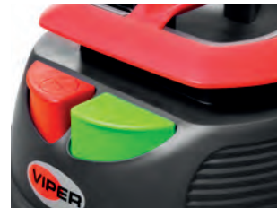
ECO button to adjust the suction power and reduce the noise