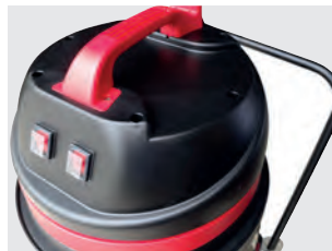
Easy handling due to ergonomic handle with cable hook and two separate on / off button