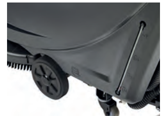
Easy to maneuver and transport: Big wheels and strong casters, making the machine well-balanced