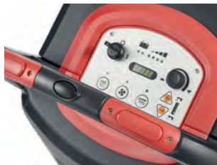
Control panel with intuitive display and buttons