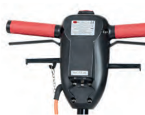
Ergonomic handle with height adjustment, safety switch and control lever for detergent tank