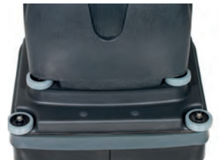
Can also be used in harsh environments, brush pressure up to 91 kg, and all-round protection