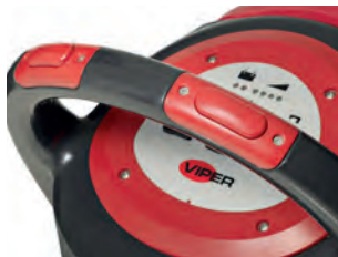
Ergonomically integrated safety switch. Each switch can be operated independently