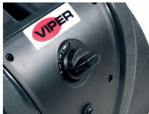
3-speed induction motor with reduced power consumption