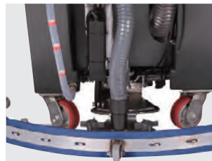
Electric actuator to adjust pressure