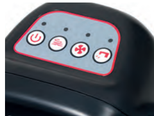
Easy to use control panel with four main functions