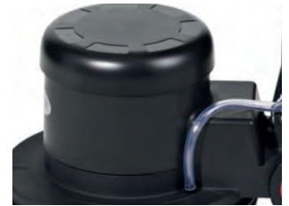
Triple planetary gear and quiet motor and gears