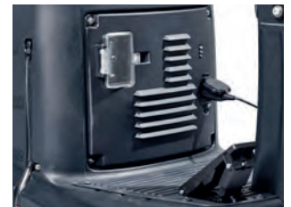
An integrated on-board charger enables easy plug-in and battery charge at any outlet