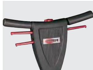
Ergonomically designed handle with height adjustment, center type safety switch and easy to use function lever