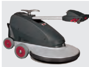
Folding handle for easy, space-saving storage and transportation of the vehicle