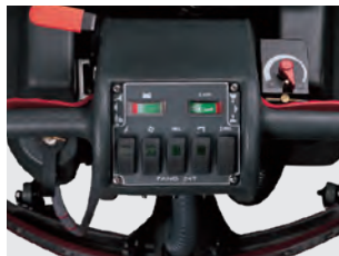
Clear operator panel with switch and battery level. In HD™ version with display pressure