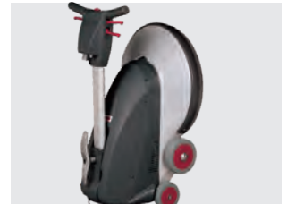
Space-saving storage in upright position. Large transport wheels for easy transport