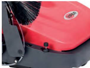
Side brooms can individual be adjusted just by turning a knob