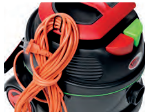
Cable holder for easy storage