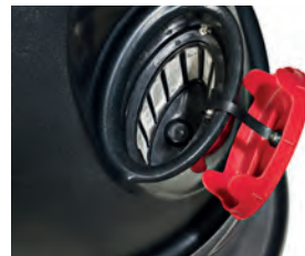
Water filling through large oval opening with filter and protective cover