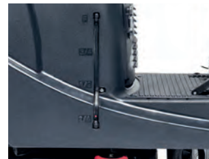
Water solution level indicator with volume visible on the tank