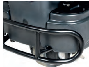
Standard front bumper protects the machine for longer life-time