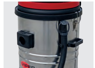
Drain hose for easy emptying of the container