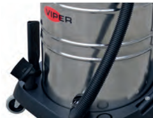
Easy storage of accessories