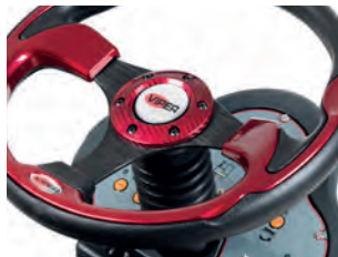
Intuitive dashboard, one touch button and userfriendly menu for operation settings