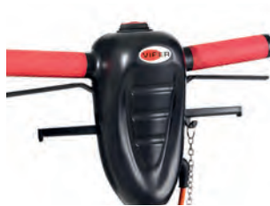
Ergonomic handle, adjustable in height, central safety button, control lever for detergent tank