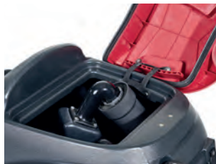
Large opening to the 73 liter recovery tank allows easy cleaning