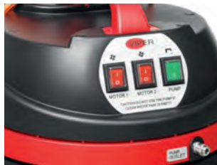
One-touch function elements for easy operation