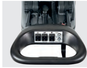
Ergonomic and adjustable handle