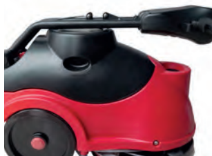
Foldable handle for easy storage