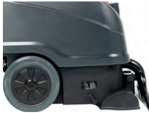
Large wheels for easy transport and maneuverability