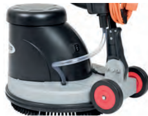
Powerful, rugged engine and large rear wheels for easy transport