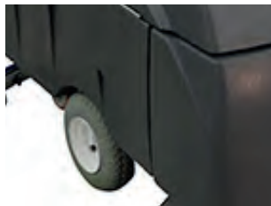
Traction wheels foam filled