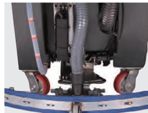
Electric actuator to adjust pressure