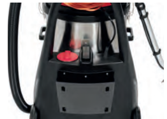
Fresh water tank integrated in the chassis.