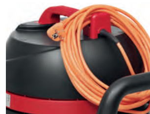
Cable holder for easy storage