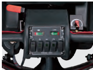
Intuitive control panel, easy to use, understandable controls with display brushes pressure