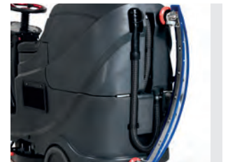
Built-in squeegee hanging system on recovery tank for easy machine transfer in narrow areas