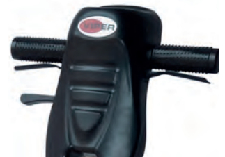
Ergonomically designed on handle and controls