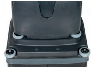
Can also be used in harsh environments, high pressure, good cleaning performance.