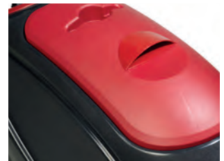
Simplified cleaning of the recovery tank, thanks to a large tank cover