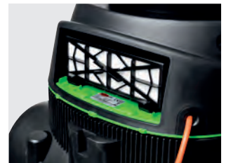
HEPA filter comes as standard