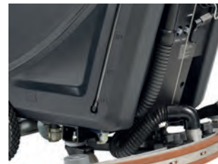
Water level indicator with volume visible on the tank