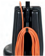
Robust metal hook for safe winding of the power cord and receiving the Leaf's Ellers as storage