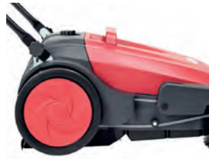
Large non marking wheel