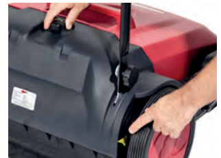
Adjustable main brush