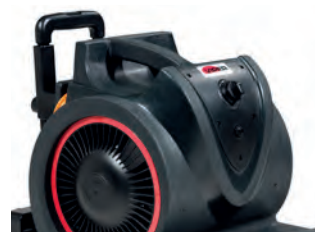
Handle for lightweight transportation